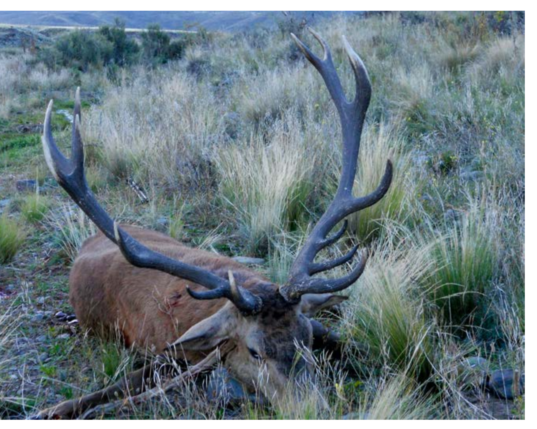
The stags that populate this region are 100% wild free-roaming game that migrate through the terrain.