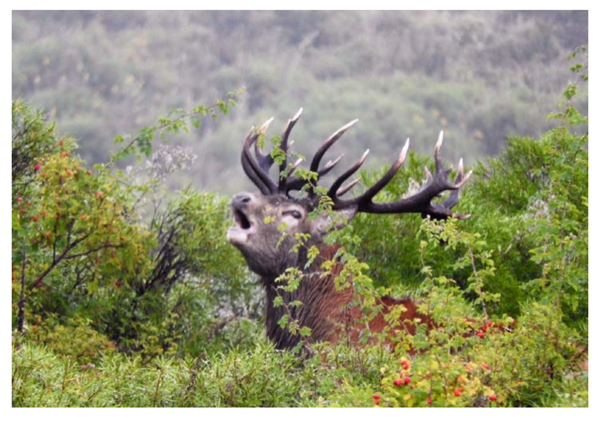
The fertile valleys of the Mendoza Andean foothills provide perfect habitat for red deer, where they develop impressive racks, with some specimens naturally reaching the 450 SCI + class