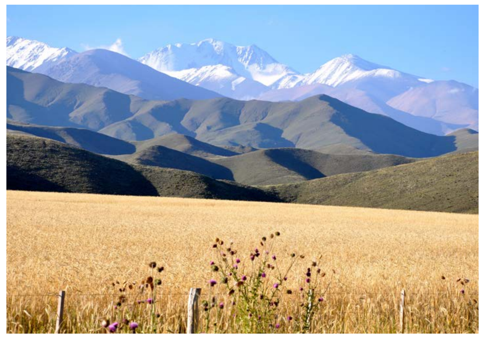
This exclusive preserve spans 25,000 acres and sits on the upper levels of a huge ranch. A couple of 20 + thousand feet peaks are within the ranch's west boundary.